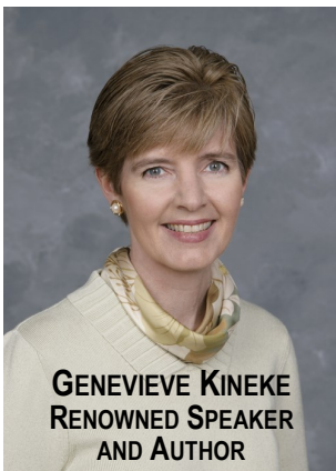
GENEVIEVE KINEKE RENOWNED SPEAKER AND AUTHOR

COME TO THE TABLE: A RENEWED ENCOUNTER WITH JESUS