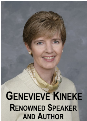
GENEVIEVE KINEKE RENOWNED SPEAKER AND AUTHOR

COME TO THE TABLE: A RENEWED ENCOUNTER WITH JESUS SATURDAY, APRIL 27, 2024 9:00 AM - 4:45 PM (MASS AT 5:00 PM)