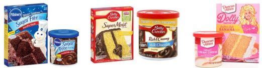
CAKE MIX & FROSTING

Have you considered answering the call to serve the poor by joining the Society of St. Vincent de Paul?