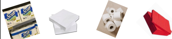
TOILET PAPER & NAPKINS