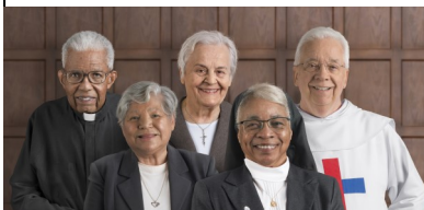
Photos: Jim Judkis. ©2023 United States Conference of Catholic Bishops. Used with permission.

Please be generous in your support of the National Collection for the Retirement Fund for Religious on December 9 & 10. This collection assists religious institutes in providing for the retirement needs of senior religious priests, brothers, and sisters. The fund also helps religious institutes plan and manage their retirement needs and programs.