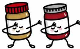
Peanut Butter and Jelly!