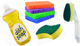
Dish Soap & Sponges

SVDP meets the 1 st and 3 rd Wednesdays of the month at 5:00 PM in the PRC! All Are Welcome!